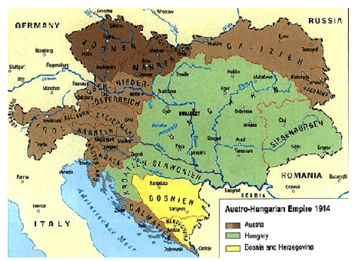
The Austro-Hungarian Empire in 1914

In 1806 the Holy Roman Empire came to an end and Austria became the Austrian Empire although it was still part of the German Confederation and it remained under German control until the Austro-Prussian War of 1866 when it was subsequently excluded from German affairs. In 1867, following this war, the Emperor Franz Josef 1 of Austria created a dual monarchy with Hungary and created the great empire of Austro-Hungary. They added Bosnia to their territories in 1878. Austro-Hungary became rich and powerful and it occupied a critical location in central Europe, forming one of the major powers of Europe, surrounded by the German, Russian, and Ottoman Empires. World War 1 brought the Austro-Hungarian Empire to an end in 1919, with Austria and Hungary becoming two separate nations. Austria was created a Republic.