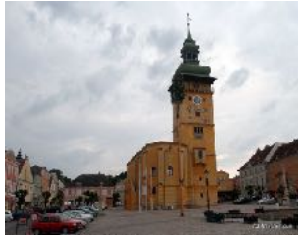
Murau 1st Small Town Symposium