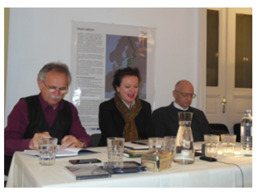
Land & Raum Magazine