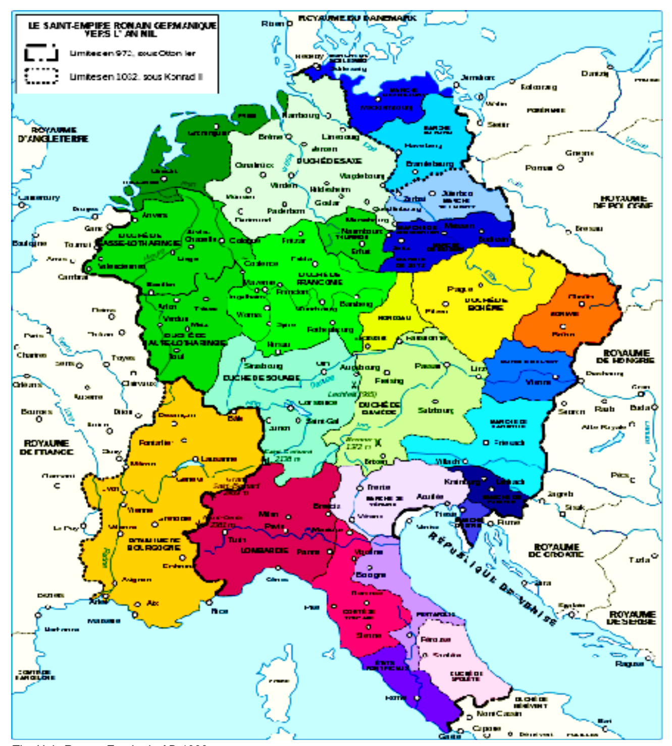
The Holy Roman Empire in AD 1000

In the 16<sup>th</sup> century Austria felt the impact from religious reformations due to the rise of Protestantism as did the rest of Central Europe, and they became embroiled in the Thirty Years War that followed. Austria resisted the protestant ideas and remained staunchly Catholic. Their response as a counter offensive was to keep the Austrian lands Catholic, firstly be persuasion but later by religious persecution, forced conversions and evictions. At the same time as this was happening, the Austrian lands were facing severe pressures from the Ottoman Turk expansions. Austria provided a 'bulwark' for Western Europe against the expansion of the Ottoman Empire westwards. The first siege of Vienna by the Turks was during 1529-1532 and they were threatened by them for the next one and a half centuries. The Turks were finally defeated and withdrew back eastwards during the late 17<sup>th</sup> century.