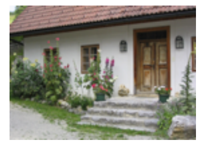
The "Mayors House" at the village plaza