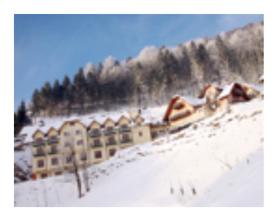
view from below