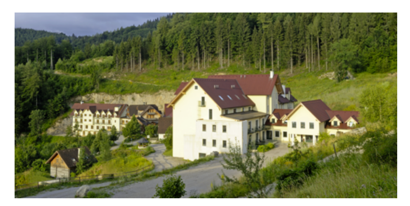
View of Entrance Area