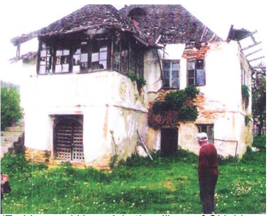
'Emblazoned House' in the village of Chiojdu Before Restoration