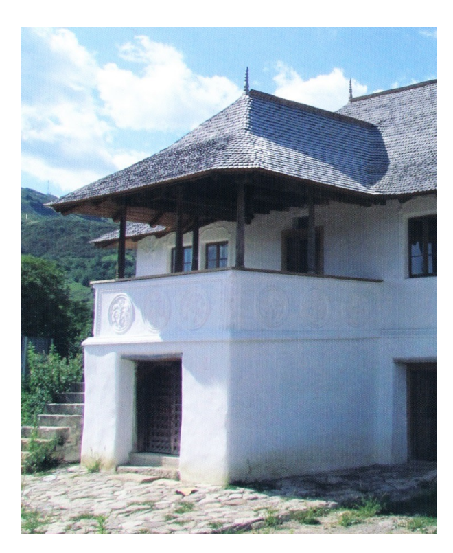
'Emblazoned House' in the village of Chiojdu

In 2015 the restoration of the 'Emblazoned House' in the village of Chiojdu, Buzău county was completed (the responsible architect being Calin Hoinărescu) and now houses a permanent exhibition dedicated to the 'Civilization of the free peasants from Wallachia' showing traditional habitats from the villages and offering spaces for practising crafts and traditional activities.