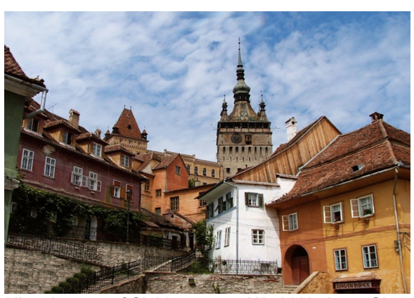
Historic town of Sighișoara – a World Heritage Site