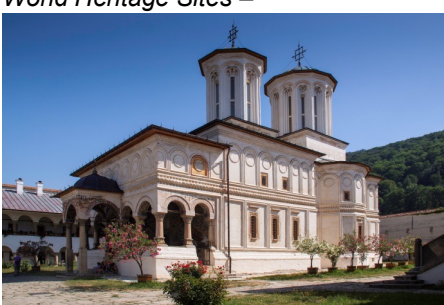
Monastery of Horezu