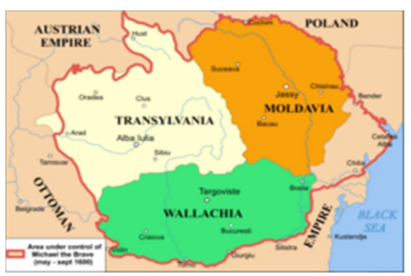
Former Regions of Romania

Transylvania became part of the Hapsburg Austro Hungarian Empire until 1918 when it proclaimed union with Romania but years of dispute did not finalise the current boundaries between Hungary and Romania until 1947. Several other boundary changes have taken place, particularly the loss of eastern Moldavia which was annexed by the Soviet Union and eventually became the new country of Moldova. Politically Romania was a Kingdom in the 19<sup>th</sup> century; and in 1947 it became a Peoples Republic and remained part of the Russian communist bloc until 1989. After the fall of communism in Europe, Romania has had many democratic changes to its government and it developed closer ties with Western Europe and the United States. Romania became a member of the Council of Europe in 1993; it joined NATO in 2004 - hosting the 2008 summit in Bucharest and became part of the European Union in 2007.