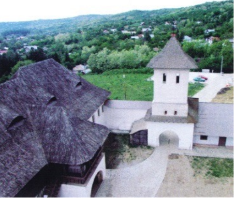
Apostolache Monastery Complex

In 2012 they completed the restoration of the former Monastery Church of Măxineni, in Brăila County, in the plains and have funding for the restoration for other parts of the medieval monastery complex enclosed by walls and organise the park area around it which will include accommodation and form an important base for religious and cultural tourism in the lowlands. Also in 2012 ECOVAST Romania moved its legal office to Apostolache village, in Prahova County, near the monastery of the same name.