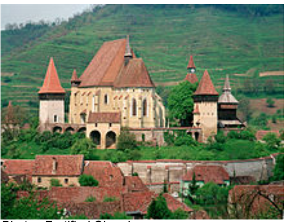
Biertan Fortified Church