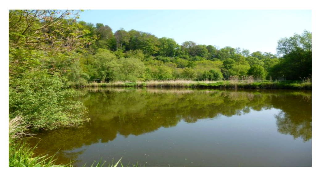
Fig. 3: Bank area of the ford across the River Werra on the slope of the Roman camp Hedemuenden (see Fig. 2 for special position).

The successful exploration of the main camp has stimulated historically interested groups for further exploration. So for the campaign of Drusus 9 B.C. the approximate locations of the marching camps from southern Hesse to Hedemuenden could be demarcated (9, p. 7 f). Furthermore the location of other bases in the north to the valley of the River Leine were outlined.