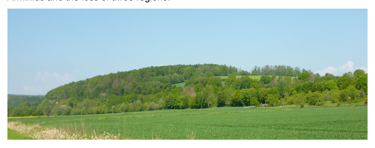
Fig. 1: View from the south east on the wooded plateau west of Hedemuenden – location of the main Roman camp.

The campaigns were accompanied by devastation of surrounding areas and forced the Germanic tribes recognition of Roman supremacy or commitment to the alliance. – After Drusus's death, leadership was passed to his brother (and later emperor) Tiberius. This led again from 8 B.C. to several campaigns across the regions east of the Rhine upto the River Elbe (13, p. 35 ff). With these undertakings, the recognition of Roman supremacy was consolidated for several years. As from the military camps, the punctual influence on the internal life of the Germanic tribes was extended collaterally. However in 2 A.D. again there was a great uprising of the north western tribes which was fought down by Tiberius in 3/4 A.D. It was followed by a solid phase of Roman supremacy and influence. This ended abruptly in 9 A.D. with the defeat of Varus against a Germanic coalition under the leadership of Cheruscan ruler Arminius and the loss of three regions.